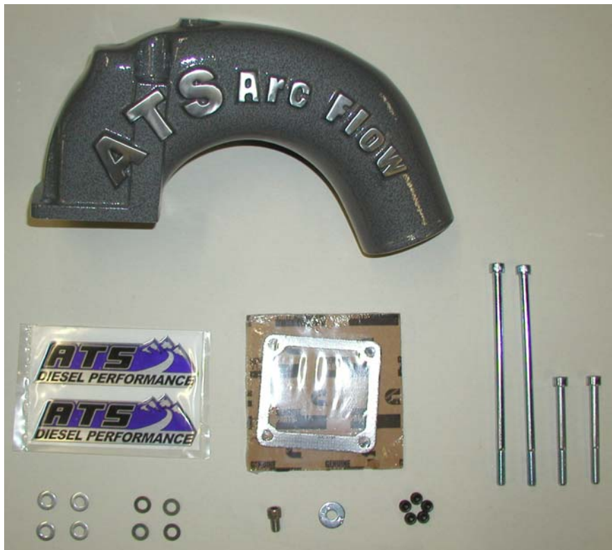
Figure 1 - 24 Valve and CR Arc Flow Kit Contents

Thank you for purchasing the ATS Arc-flow Intake Manifold. This manual is to assist you with your installation. If installing for a customer, please pass this manual on to your customer for future reference.