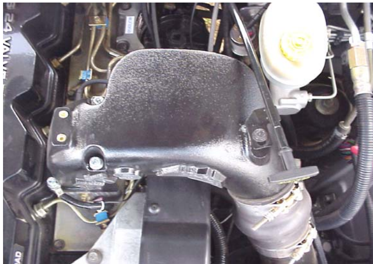
Figure 4 - Arc-Flow Intake Manifold After Installation

Note: Figure 4 shows a 24V Cummins, but 12V and Commonrail models look similar.