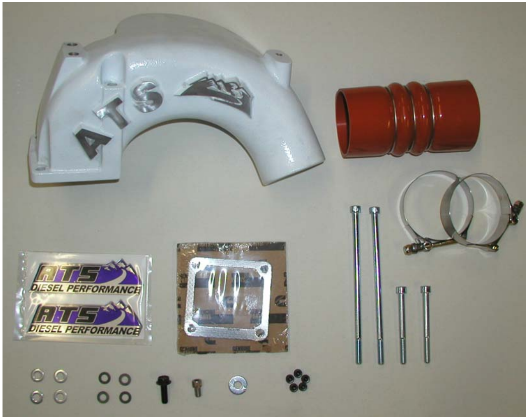
Figure 1 - 12 Valve Arc Flow Kit Contents

Thank you for purchasing the ATS Arc-flow Intake Manifold. This manual is to assist you with your installation. If installing for a customer, please pass this manual on to your customer for future reference.