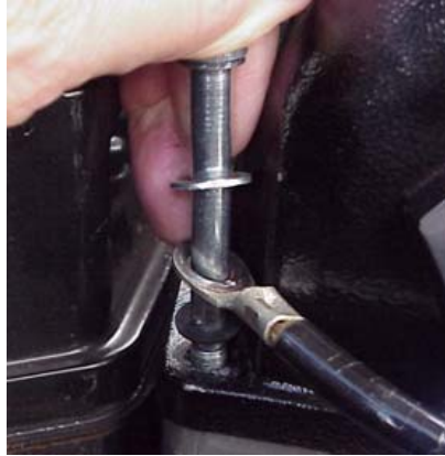
Figure 3 - Installing Ground Wire, Note Rubber Washer Below Ring Terminal