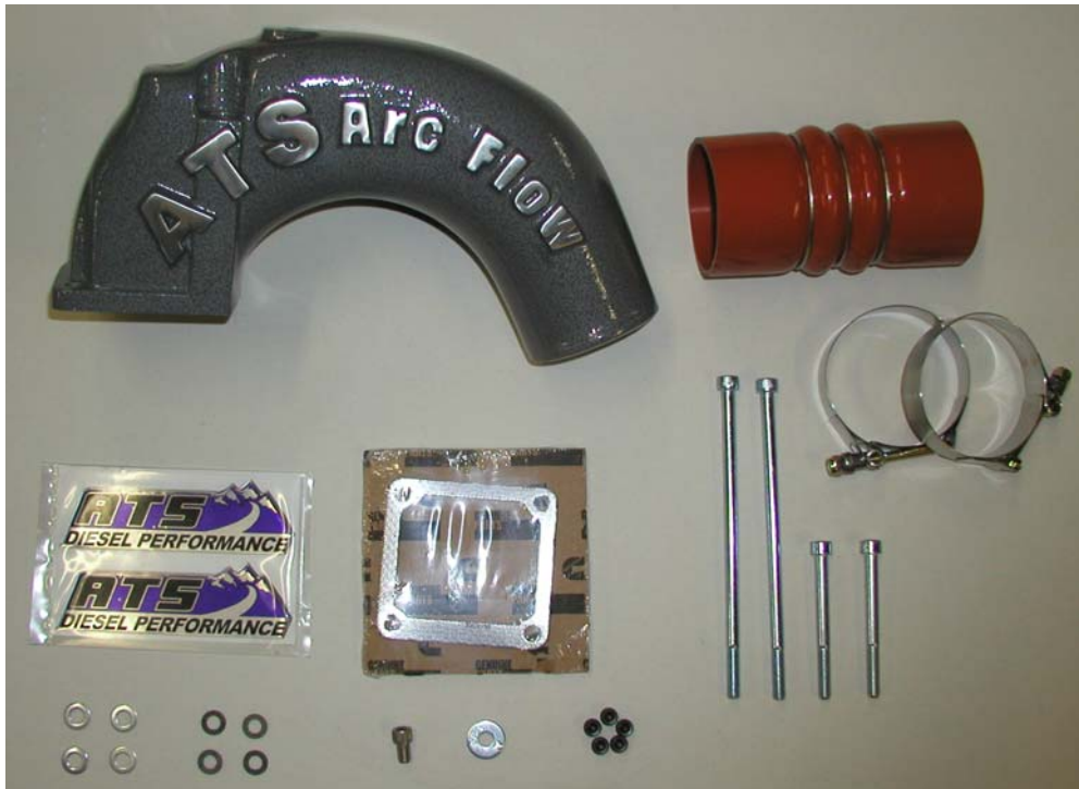
Figure 1 - CR Arc Flow Kit Contents

Thank you for purchasing the ATS Arc-flow Intake Manifold. This manual is to assist you with your installation. If installing for a customer, please pass this manual on to your customer for future reference.